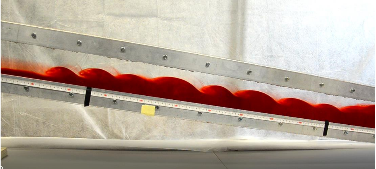
Figure 2. A fluid instability is triggered in our experimental facility, between a layer of brine (10% salt/water solution, red-colored) and a layer of fresh water. A movie of the experiment is available at https://drive.google.com/open?id=1xz5WB57FMXuC3uSHbU4rzLbhLCVa11yT

The students will conduct different experiments to investigate the effect of density stratification between layers, and the effect of the tilting angle.