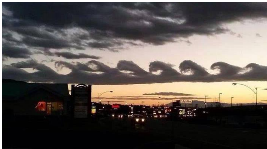
Figure 1. Kelvin-Helmholtz instability in the atmosphere.

It is possible to produce a stratified shear-flow instability under controlled conditions in a laboratory. The experimental facility consists of a long horizontal channel with high aspect ratio. The fluid-containing part of our channel is 192 cm long and has a rectangular cross-section of 10 x 2 cm. The total size is 200x20x4 cm. The apparatus is made of a wooden frame with closed ends, supporting two plexiglass sides. Silicone glue and metallic bands are used to make it watertight. At one end, an inlet tube provides the fluid supply. At the other end, an outlet tube is used for removal of air inside the channel and for draining the liquid after the experiment. The channel is filled from the bottom with two layers of fluids - the upper water (lighter fluid) and the lower solution of water and salt (the denser fluid) - while it is being kept tilted by 45 degrees. One of the two layers is typically colored with dye to visualize the instability. When completely filled, the channel is slowly returned to a horizontal position. Afterwards, the channel is quickly tilted through a small angle (around 10 degrees). A shear flow is then generated at the center of the tank, due to the acceleration of the lower layer which pushes up the lighter layer. The instability arises after few seconds.