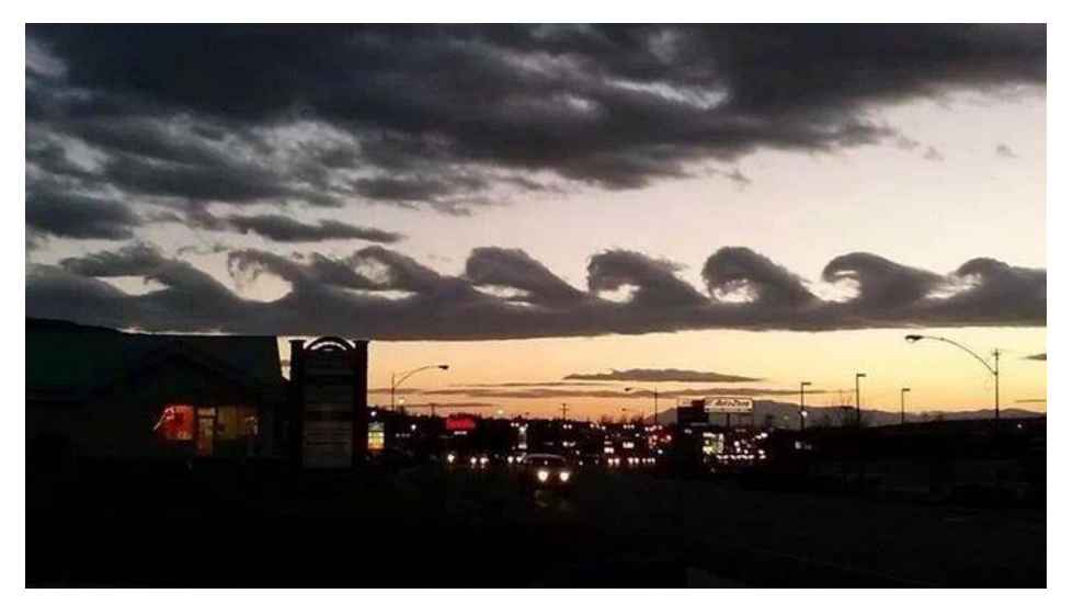
Figure 1. Kelvin-Helmholtz instability in the atmosphere.

It is possible to produce a stratified shear-flow instability under controlled conditions in a laboratory. The experimental facility consists of a long horizontal channel with high aspect ratio. The fluidcontaining part of our channel is 192 cm long and has a rectangular cross-section of 10 x 2 cm. The total size is 200x20x4 cm. The apparatus is made of a wooden frame with closed ends, supporting two plexiglass sides. Silicone glue and metallic bands are used to make it watertight. At one end, an inlet tube provides the fluid supply. At the other end, an outlet tube is used for removal of air inside the channel and for draining the liquid after the experiment. The channel is filled from the bottom with two layers of fluids - the upper water (lighter fluid) and the lower solution of water and salt (the denser fluid) – while it is being kept tilted by 45 degrees. One of the two layers is typically colored with dye to visualize the instability. When completely filled, the channel is slowly returned to a horizontal position. Afterwards, the channel is quickly tilted through a small angle (around 10 degrees). A shear flow is then generated at the center of the tank, due to the acceleration of the lower layer which pushes up the lighter layer. The instability arises after few seconds.